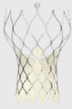
Evolut R 23 mm Valve