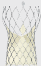
Evolut R 26 mm Valve