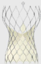
Evolut R 29 mm Valve