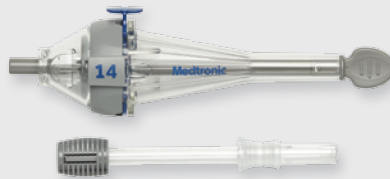
EnVeo PRO Loading System 23, 26, 29 mm TAV